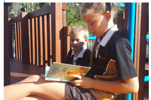
Our Kindergarten students enjoying reading time with their buddies!