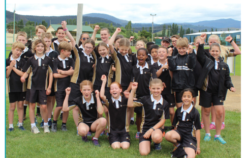
Huon and Channel Athletics Carnival photos