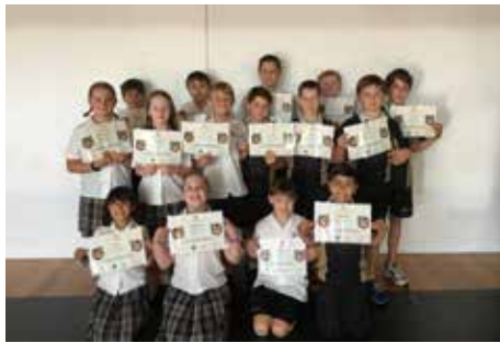
Pictured - Primary School Code Club members and Challenge participants