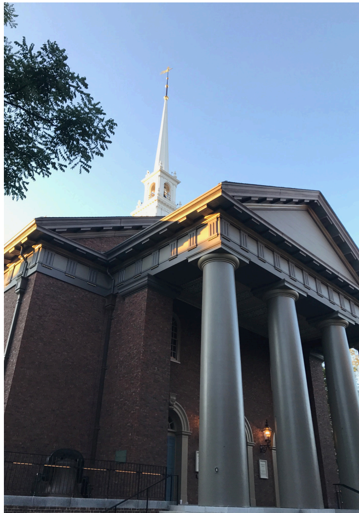
Pictured Harvard's Chapel