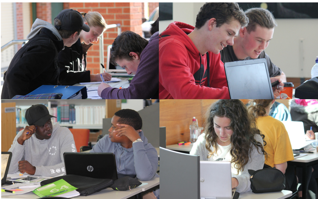
SENIORS STUDY DAY