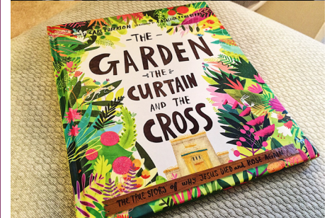
Miss Byslma read The Garden, the Curtain and the Cross and sang Easter songs