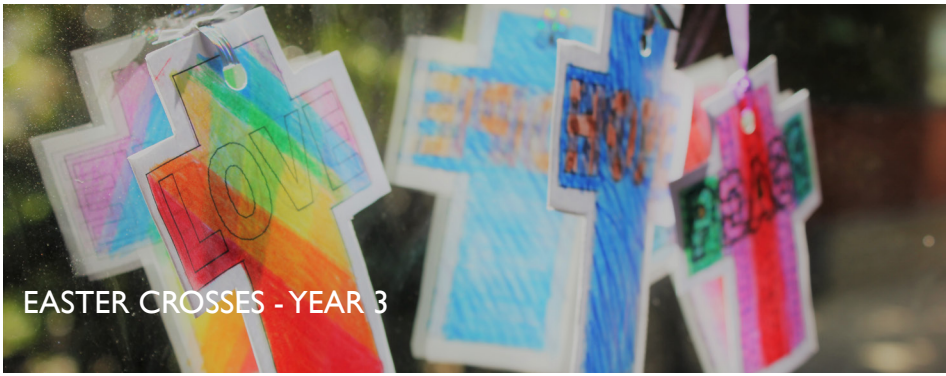
EASTER CROSSES - YEAR 3