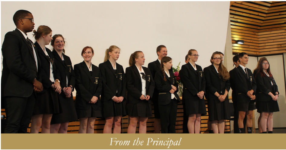
From the Principal