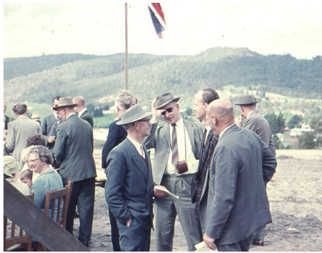
(Left) Calvin Building site 1960 (Right) Official school opening 1962