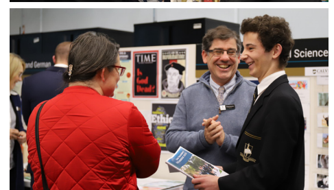
Photos: Senior Secondary Information Night