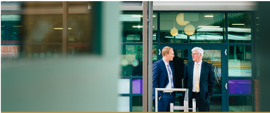
From the Principal