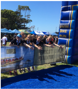
Year 7 girls – at the finish line cheering on all the competitors as they crossed the finish line.