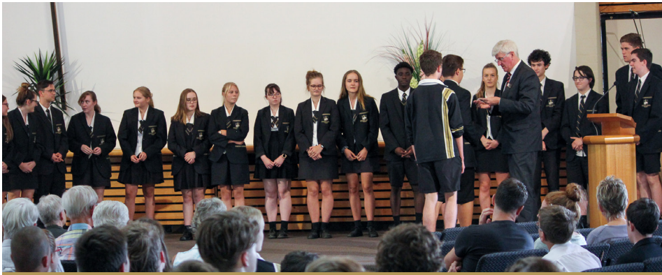
From the Principal